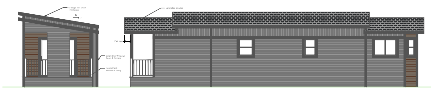
1 A8 Hitch Elevation SCALE: NTS