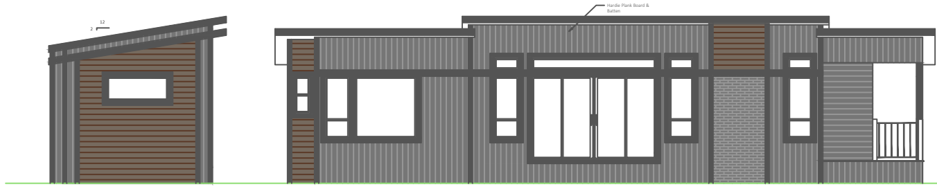
3 A8 Rear Elevation SCALE: NTS