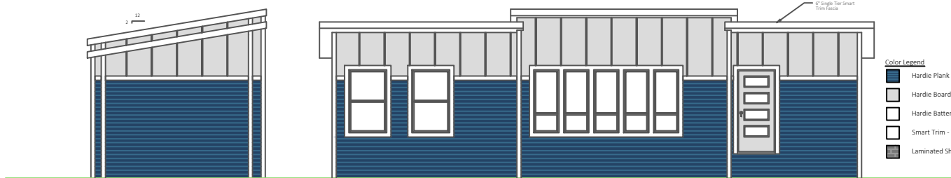
3 Rear Elevation A8 SCALE: NTS